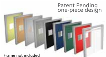
Frame not included