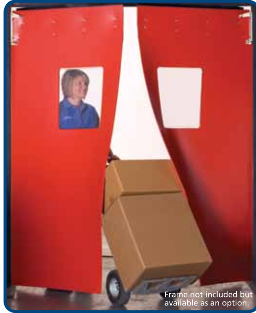
Frame not included but available as an option.

The Aleco Optima ImpacDor® is an exclusive patent pending one-piece flexible PVC panel door designed for light to medium traffic. The flexible ImpacDor® is ideal for pallet jack, pushcart, pedestrian and light to medium forklift use.