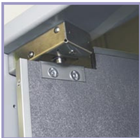
EZ hinge system