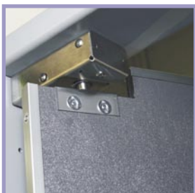
EZ hinge system