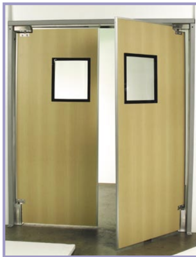
Shown with optional jamb guards

The Aleco ImpactDor® FS-500 is the perfect solution for demanding food service, retail and light industrial applications seeking to provide a visual barrier or a damper to air currents in busy doorways. Colorful 1/8" (3mm) ABS facings are bonded to a 1/2" (13mm) solid core to resist palletized loads, yet remain light enough to swing freely in high volume foot traffic. This versatile, attractive door is supported by the easily installed EZ hinge system for two-way 125 degree swing. The hinge's unique "offset pivot" ensures smooth, effortless operation to facilitate traffic flow.