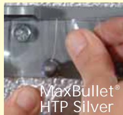
MaxBullet® HTP Silver

Aleco's MaxBullet® HTP Silver Our exclusive cross-linked polymer technology is more cost-effective and super tough.